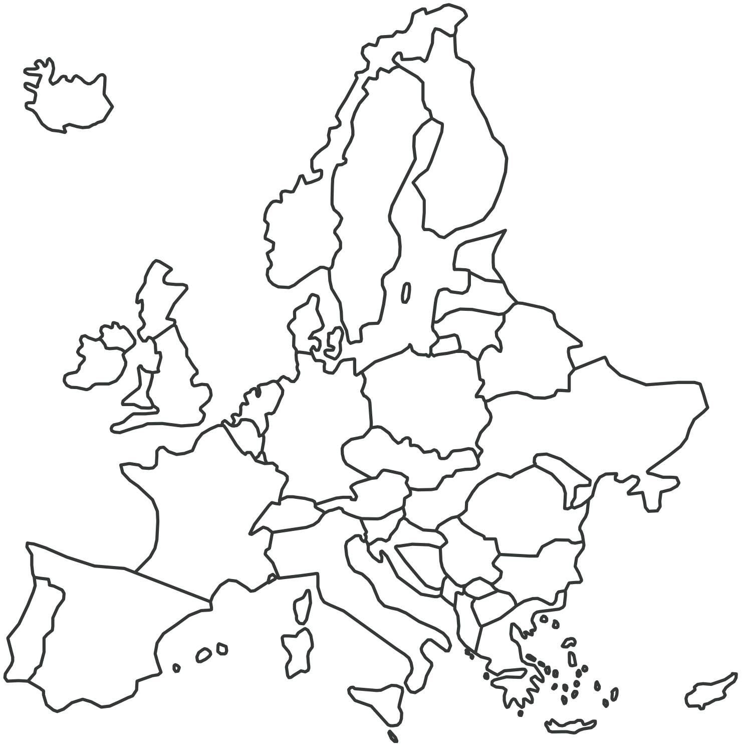
Outline Map of Europe (not to scale)