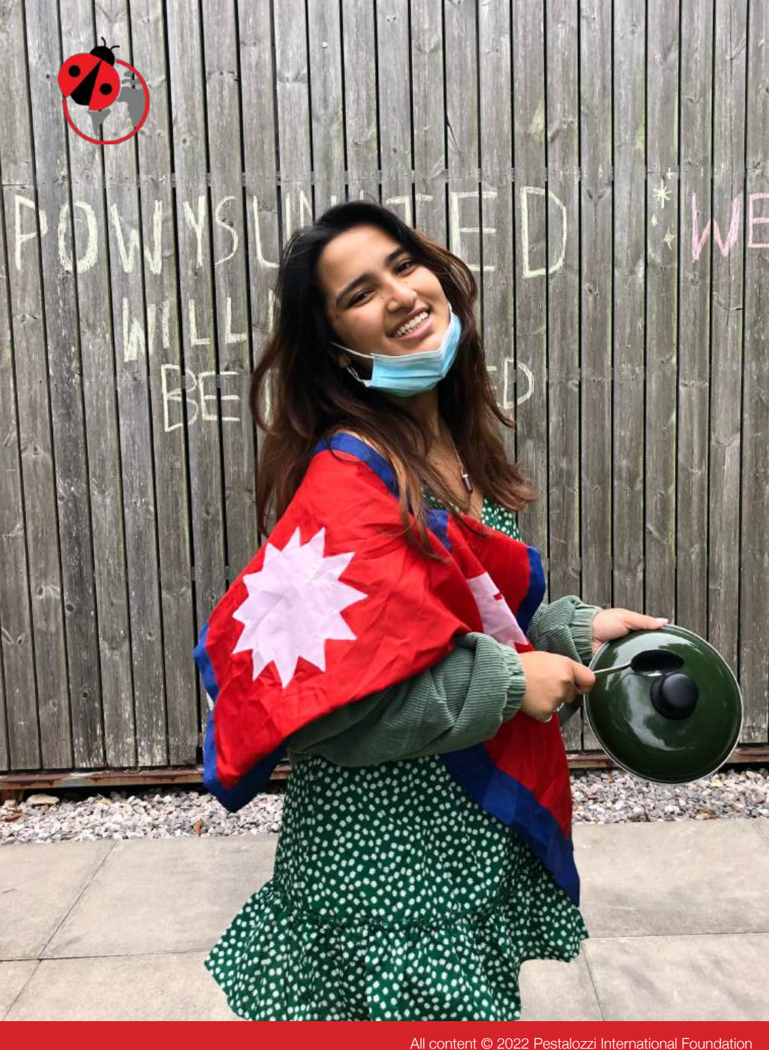
All content © 2022 Pestalozzi International Foundation Registered Charity Number 1098422